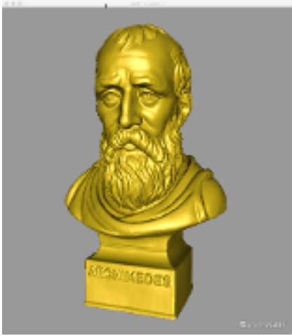
X3D rendering of 3D scan of sculpture